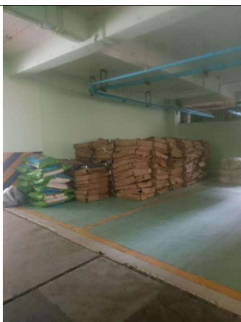
Tents, beds and blankets are temporarily stored in a carpark near to Mandalay General Hospital