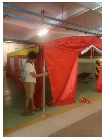
Volunteers learning to erect the tent and stretcher bed on 28 Apr 2025