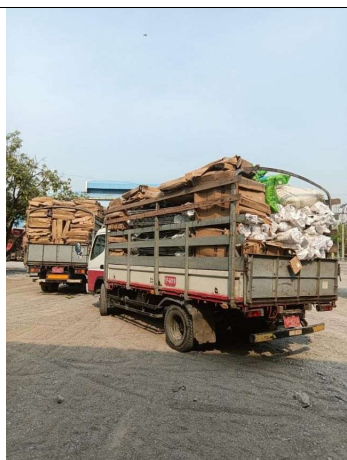
Lorries with the tents, beds and blankets arrived in Mandalay on 28 Apr 2025 at 2pm

On behalf of the victims and our fund-raising committee, we would like to thank you once again for your generous donations.